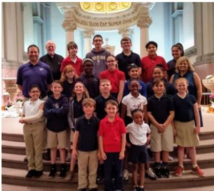
The House of Kateri Tekakwitha picture taken in the school year of 2018-2019.