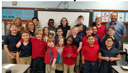
The House of Kateri Tekakwitha picture taken in the school year of 2019-2020.

Kateri Tekakwitha is known as Lily of the Mohawks . She is the patron saint of the environment and ecology, people in exile and Native Americans.